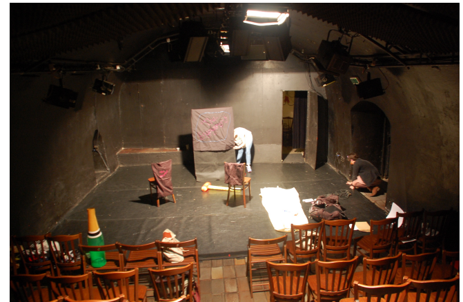
Stage in working lights