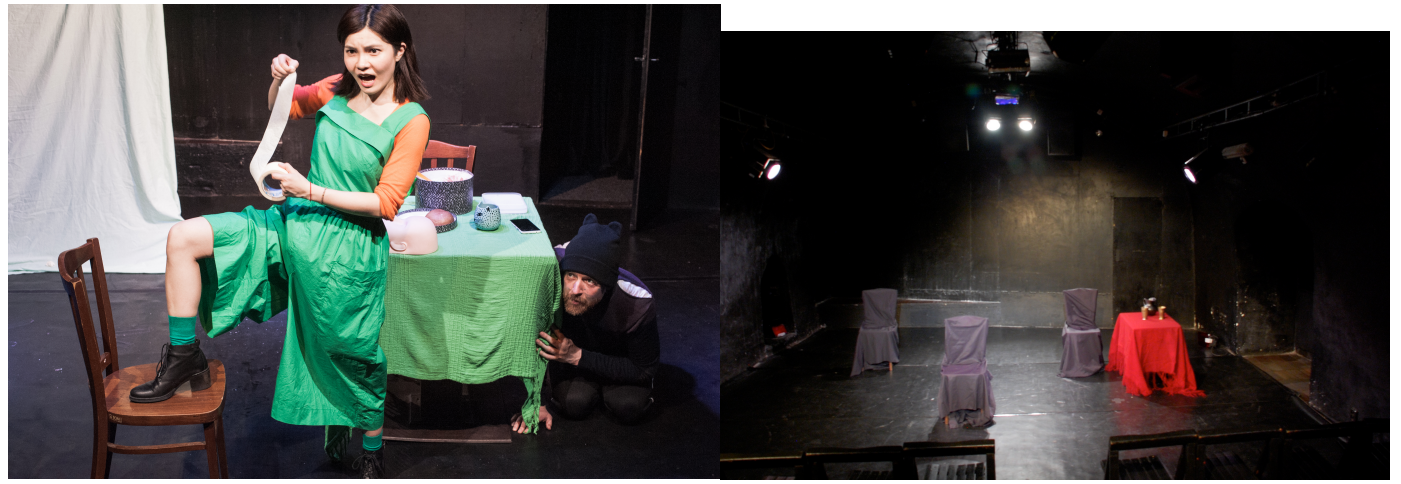
'What Next?', 小丑不丑劇團 CANU THEATRE, 2018

https://drive.google.com/open?id=0B4LaZ1IM6qtuUFY0MFBITnZOTTQ