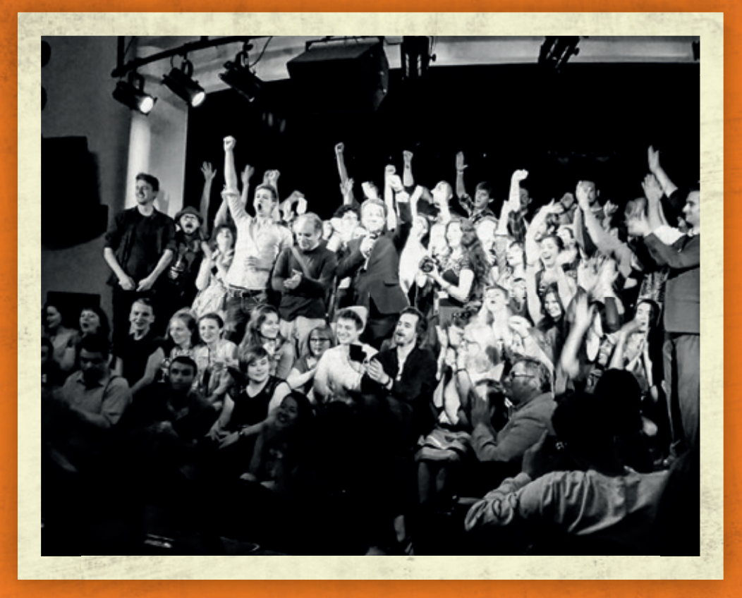
THE 'FRINGE FAMILY' CELEBRATING THE END OF FRINGE 2016